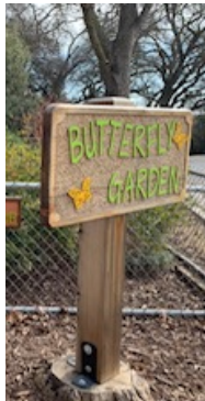
Butterfly Garden Mavis Stouffer Park